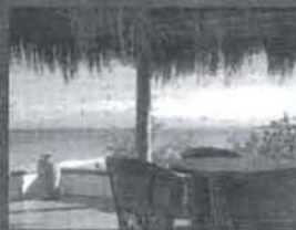
Beachfront Living Casa Blanca 3 BR, 2 BTH MLS# 14-1421 $699,000