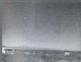
Ocean view lots Build your own custom home STARTING AT $17,900