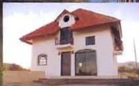
Villa Anita Ocean View Home $129,000 - Total sq. ft. 1,029.1 2 bedrooms, 2 full baths MLS: 14-1878