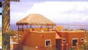
Ocean View Home Casa Santa Ana $289,000 - Total sq. ft. 3,228 3 bedrooms, 3 full baths MLS: 14-1183

Office: 612-114-0374 anamaria@diamanteassociates.com www.diamanteassociates.com