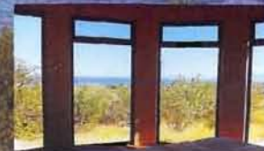
Ocean View Casa del Viento $159,000 - Total sq. ft. 1,119.04 1 bedroom, 1 1/2 baths MLS: 15-180