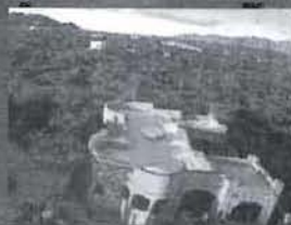
Spectacular Custom Home Casa de Piedra 2 BR, 3 BTH MLS# 15-398 $499,000