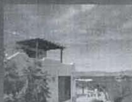
Panoramic Views Casa Luna Miel 3 BR, 2 BTH MLS# 14-598 $229,000