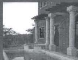
Luxury Home w/pool & spa Casa Catarina 3 BR, 3 BTH MLS# 14-1691 $329,000