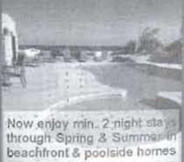
Now enjoy min. 2 night stays through Spring & Summer in beachfront & poolside homes