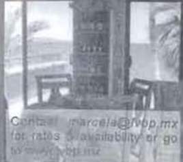
Contact margela@lvbp.mx for rates & availability or go to www.lvbp.mx